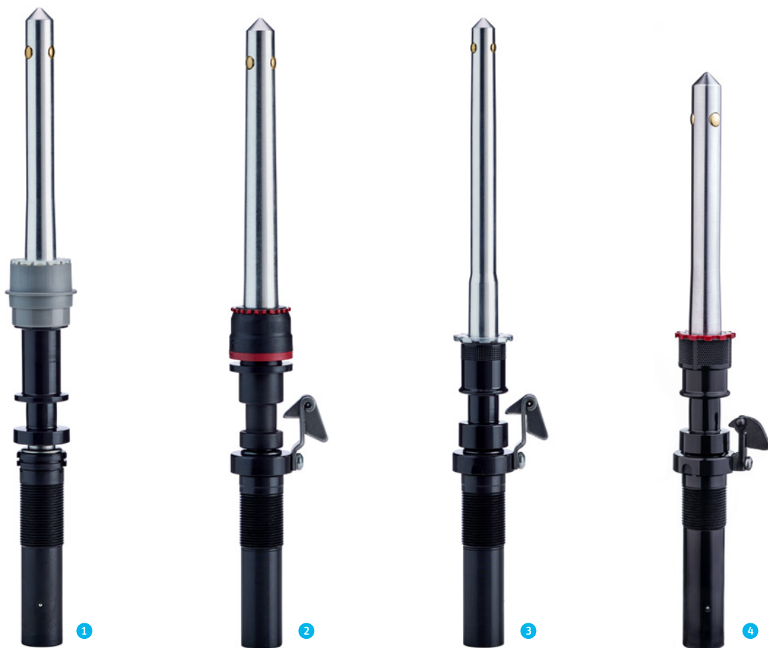
1. LENA with SERVOfrip 2. LENA with CROCOdoff 3. LENA with steel cutter 4. LENA with EASYdoff